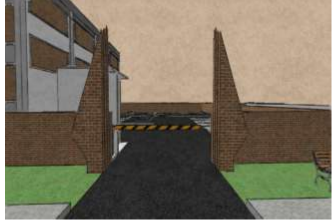
Fig. 6. Entrance

artistic. The shape part of the town square is aimed at giving visitors the impression of being very familiar with the area. The form is deliberately not taking from the form of a very typical temple in the city area of Mojokerto or Majapahit, because seeing from the function of the building itself in the form of a commercial area so as not to impress backwards the use of the icon of this square becomes one of the choices so that the building is better known from which area this building was built. With its large dimensions and also the material used using red bricks, it is a good collaboration between the concept of a modern form and its local material.