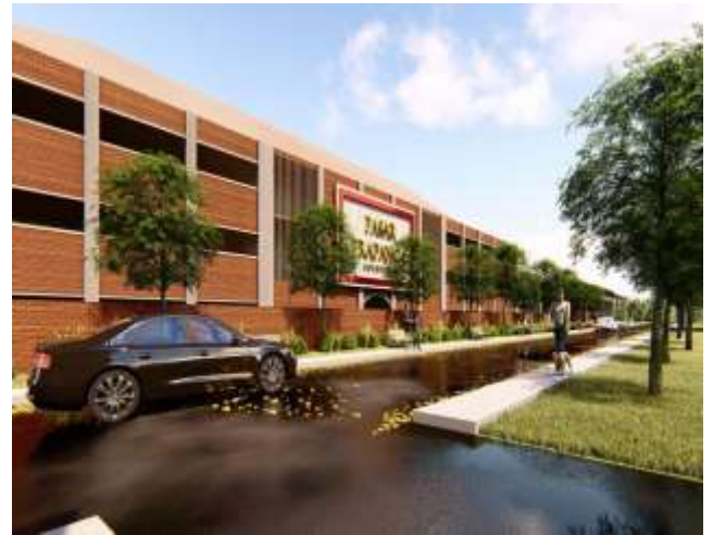
Fig. 3. Shape of the Building (source: Wijaya)

In the body of buildings in some parts using brick and wood as ornaments characteristic of architectural identity in Mojokerto. (See Figure 3). The use of ornaments dominated by bricks on the front of the building gives a very strong value to the identity of the building. The unidirectional brick pattern gives a good aesthetic appearance. The use of brick ornaments is intended so that visitors when visiting have a harmonious impression when first entering or passing through the market area. The columns in the building do not use brick ornaments, only concrete and plaster without any special ornaments. The combination of local and modern ornaments has a positive value, so that the building is not rigid and there is harmony of ornaments that complement each other.