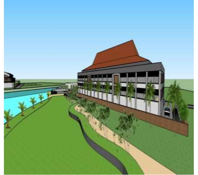
Fig. 5. Back Elevation

The application on the rear view of the building combines brick ornaments and the use of steel in the ornaments used. In the application on the back of the building which is facing directly on the waterfront area, the brick ornaments used are not much like in the front. There are more openings in the area than the front view. Some parts are made like a frame in which the brick ornaments are given. And the other part is just a flat wall and also integrated by a grill made of steel that serves to minimize sunlight from the west. So that market visitors can enjoy a good view to the west facing directly with waterfront.