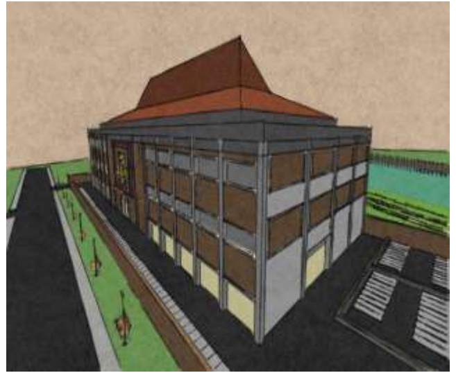
Fig. 2. Roofing Shape

function as a commercial area is a positive value for efforts to preserve the culture implemented in buildings in this modern era.