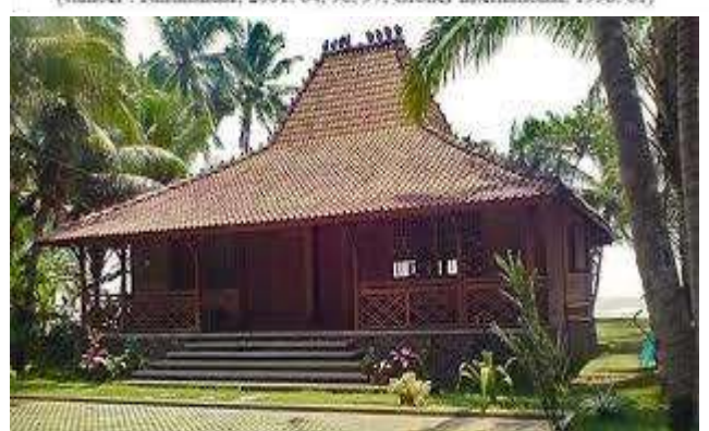
Fig. 1. Ornament and Joglo House (source: Wijaya)

Bebernpa Ornamen Tradisional Jawa (telah diolah kembali) (sumber : Ismunandar, 2001: 64, 96, 97; Grolier International, 1998: 61)